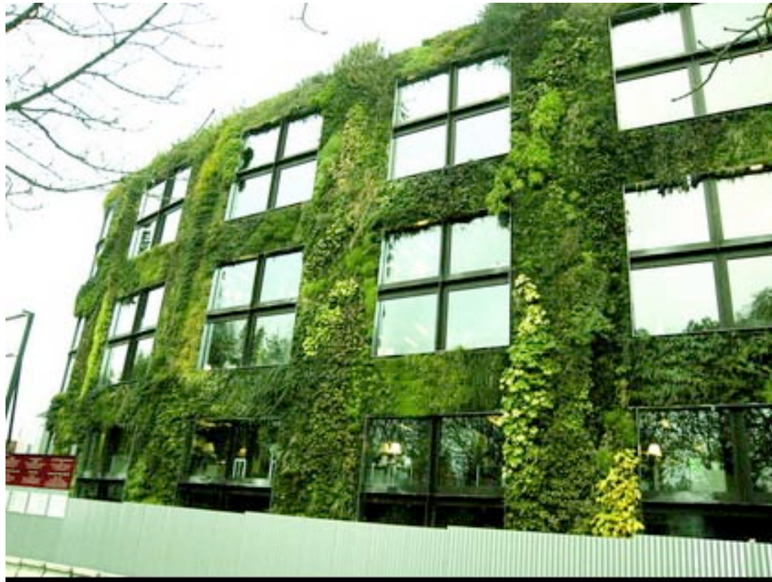
PATRICK BLANC - PARIS