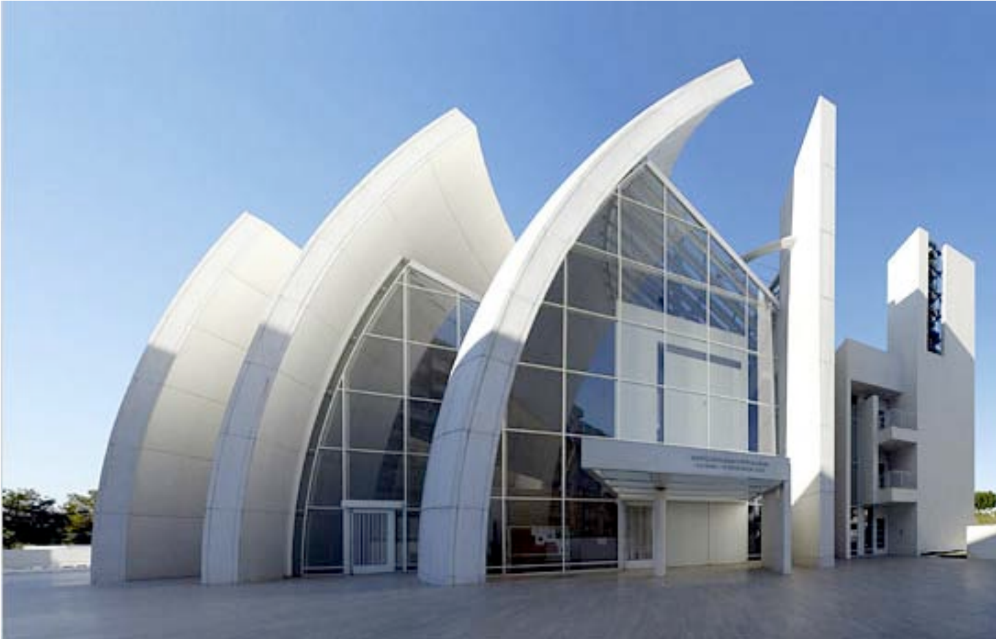
RICHARD MEIER - ROME