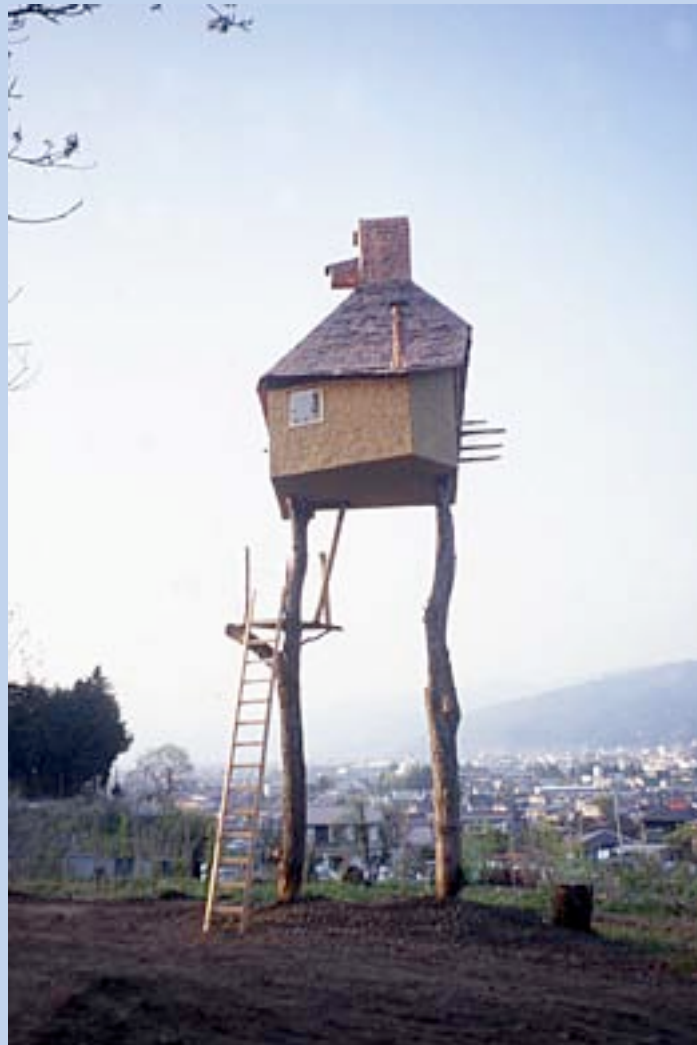
TERUNOBI FUJIMORI + ROJO - JAPAN